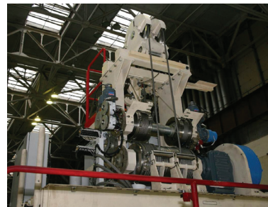
Failure-proof lifting system