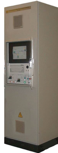
Diakont fuel sipping unit